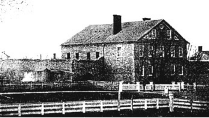
Ontario County Jail 1789