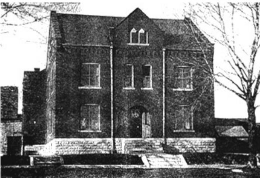
Ontario County Jail 1815 - 1895