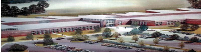
Ontario County Jail 2003

The process for building a new jail facility is very lengthy and time consuming. This project started in 1998 with the creation of the "Jail Project Committee" (JPC) by the Board of Supervisors.