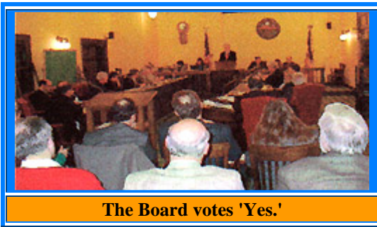
The Board votes 'Yes.'

The process for building a new jail facility is very lengthy and time consuming. This project started in 1998 with the creation of the "Jail Project Committee" (JPC) by the Board of Supervisors.