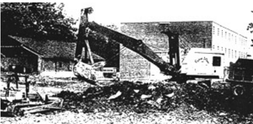
Ontario County Jail Expansion 1981 - 2003