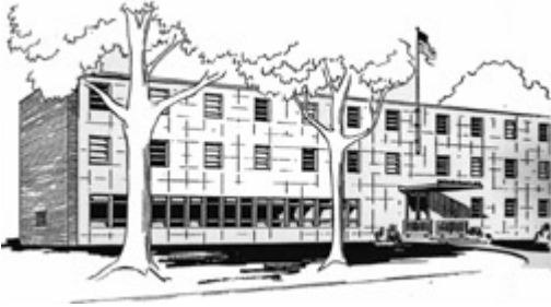
Ontario County Jail Construction Rendition 1961 (74 Ontario Street)

1961 – 1995 The new jail [1961] was estimated to have cost $530,000.