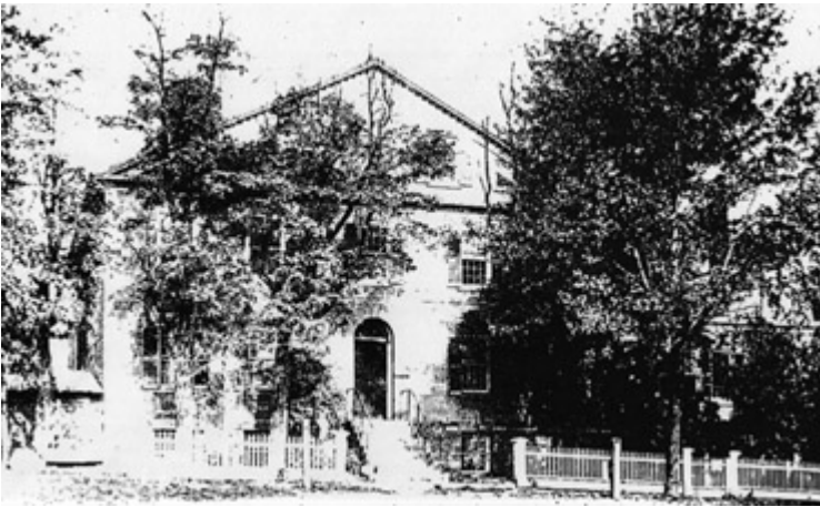
Ontario County Jail 1789 - 1815