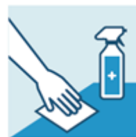
Keep objects and surfaces clean