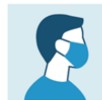
Wear a mask only if sick

If you have recently visited China, Iran, South Korea, Italy, Japan or Hong Kong phone your healthcare provider for instructions.