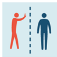
Avoid contact with others