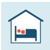
Stay at home