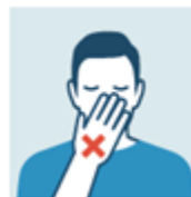
Don't touch your face