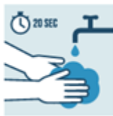
Wash hands with soap and water for 20 seconds