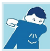
Cover your mouth and nose