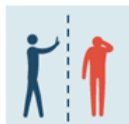
Avoid contact with sick people